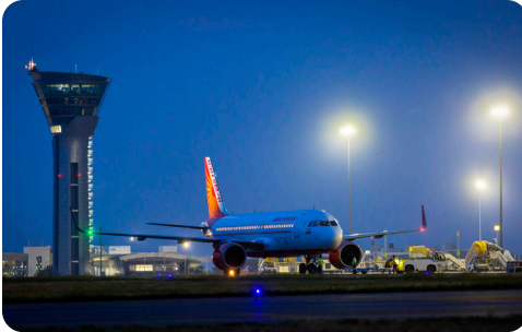
Hyderabad International Airport, India