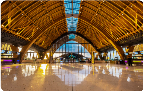
Mactan Cebu International Airport, Philippines