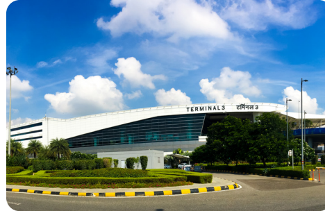
Delhi International Airport, India