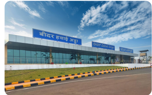
Bidar Airport, India