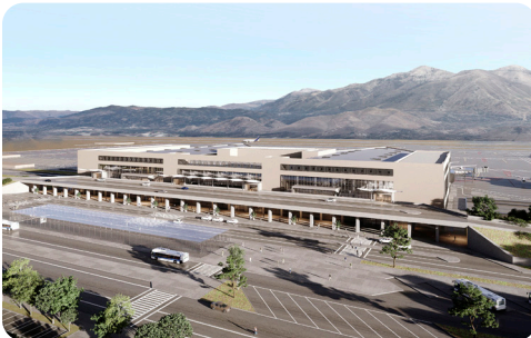
Heraklion Crete International Airport, Greece