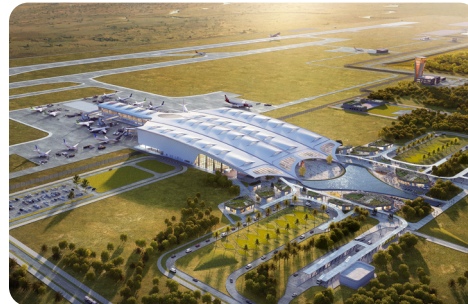
Bhogapuram International Airport, India