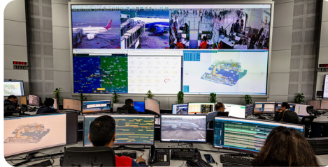
IT Systems Management