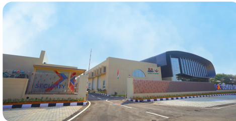
School of Aviation