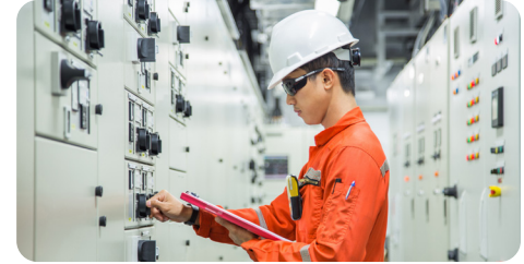
Engineering & Management Services