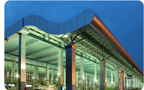
Nagpur International Airport, India