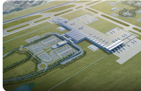
Kualanamu International Airport, Indonesia