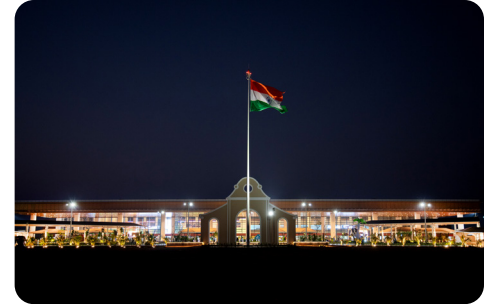
Goa International Airport, India