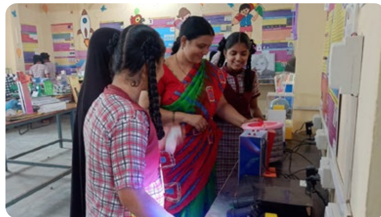
STEM labs in Govt. Schools to promote scientific temper among children