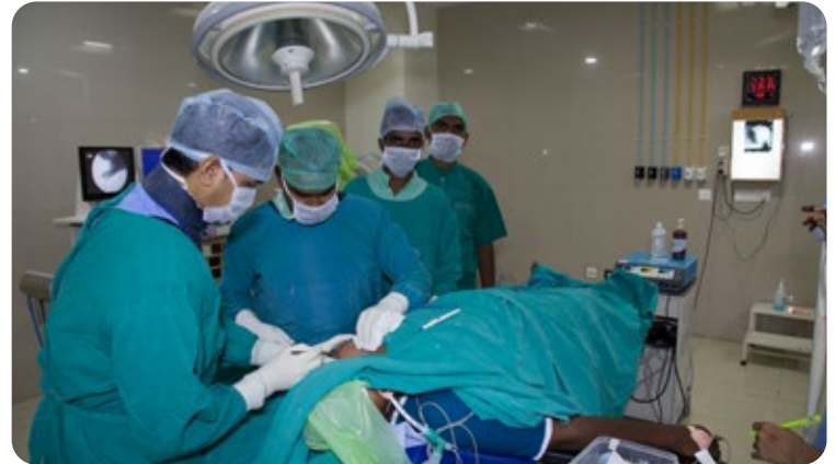
Specialised Surgeries and Procedures