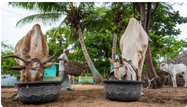
Support to dairy farming