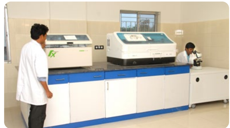
State-of-the-art lab with fully automatic immunology analyzers