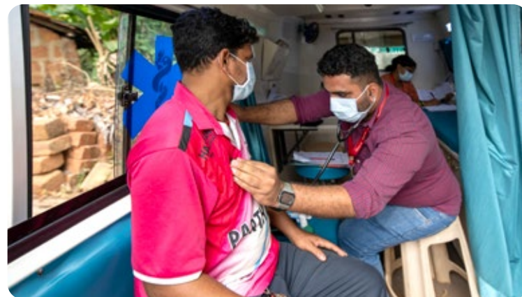
Regular health camps conducted at various project locations