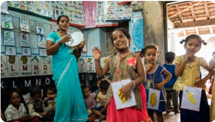
GMRVF works with about 100 Bala Badis / Anganwadis in remote villages as well as in slums & labour colonies