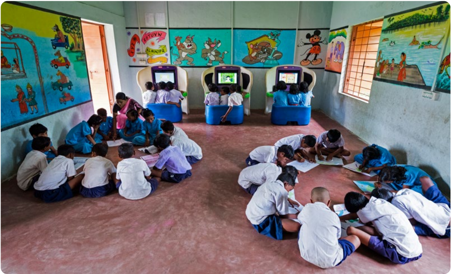
Computer-aided education for government school children