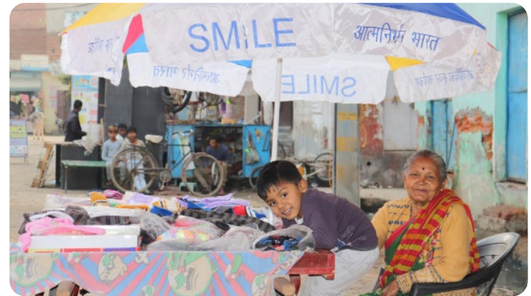
SMILE initiative to support women micro-entrepreneurship