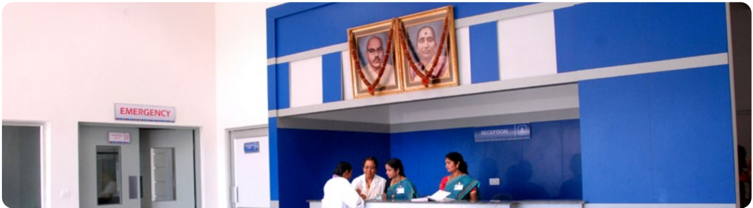
Reception at Emergency Ward