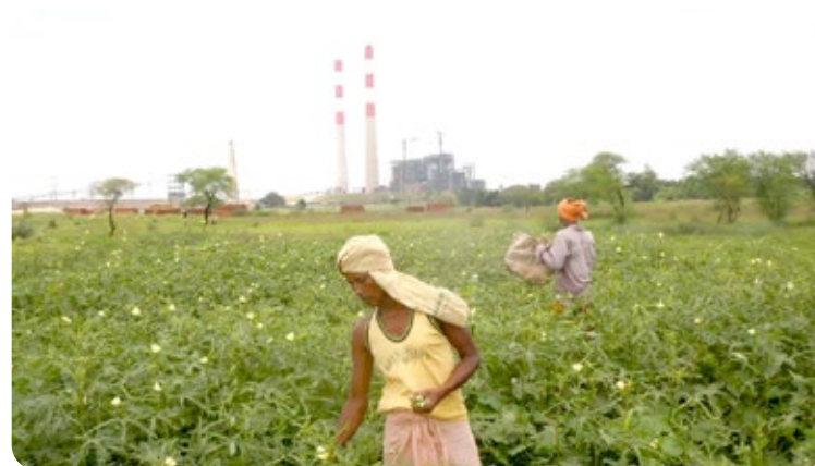
Initiatives to improve farm productivity