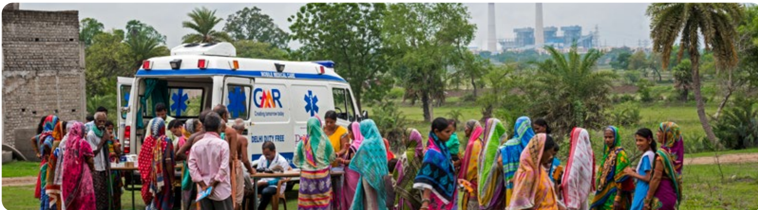
8 Mobile Medical Units that are operated in Delhi, Hyderabad, Goa, Holi-Bajoli, Warora, Kamalanga and Rajam, provide about 15,000 treatments every month esp to the elderly.