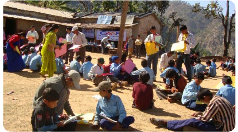
Creative activities for children