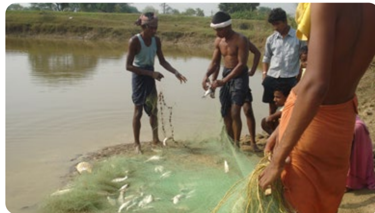
Support to fish farming in individual and community ponds