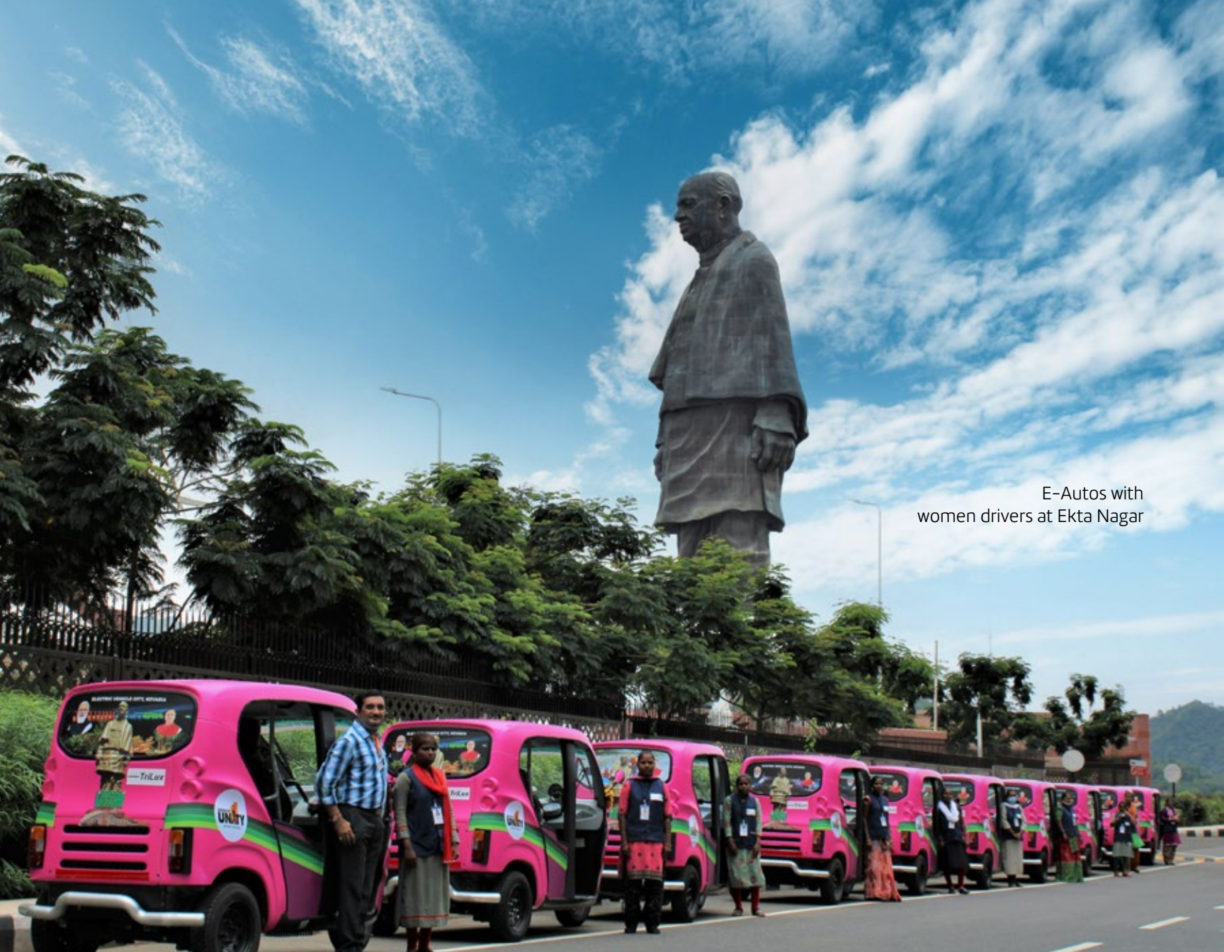
E-Autos with women drivers at Ekta Nagar