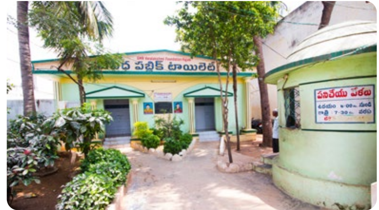
Focus on Swachh Bharat : Building and maintaining rural and urban community toilets