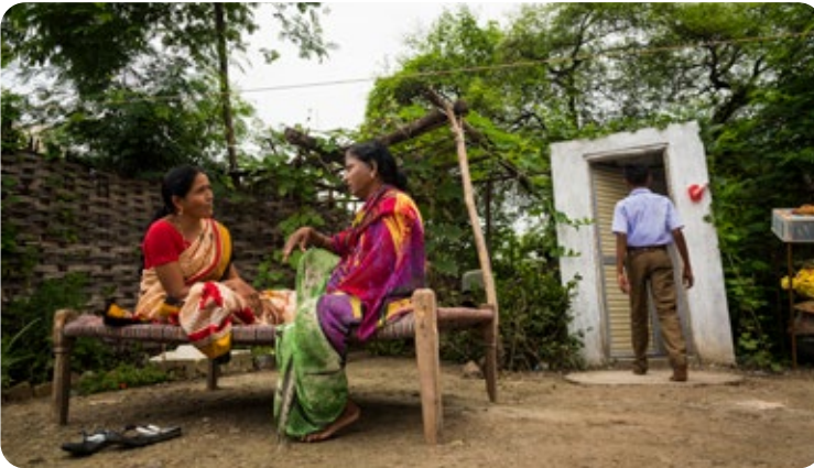
Focus on Swachh Bharat : Facilitating individual toilets in villages