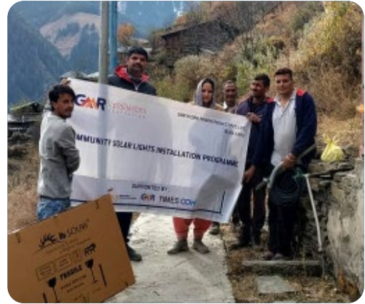
Provision of Solar Streetlights