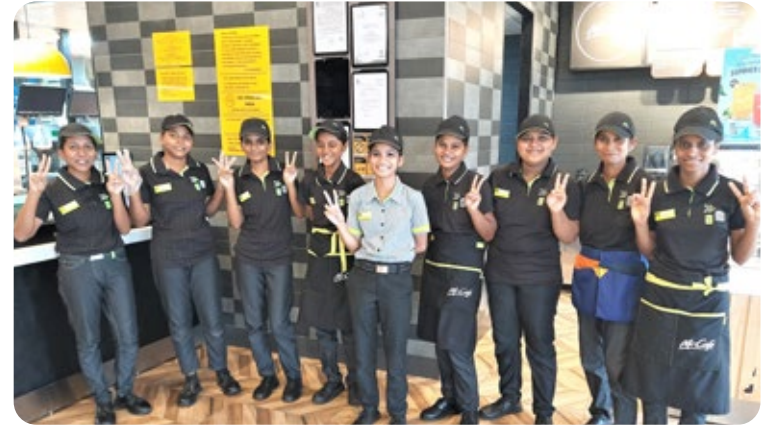
Trainees from the Ekta Skill Development Centre works at the Asia's First all female McDonalds outlet