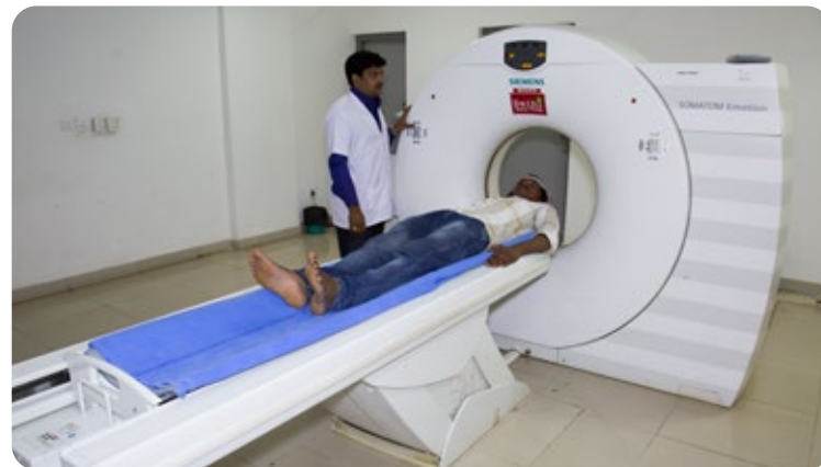
Latest 6 Slice CT Scan