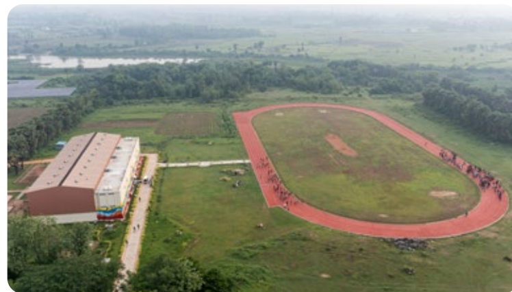
Sports Complex at GMR Institute of Technology