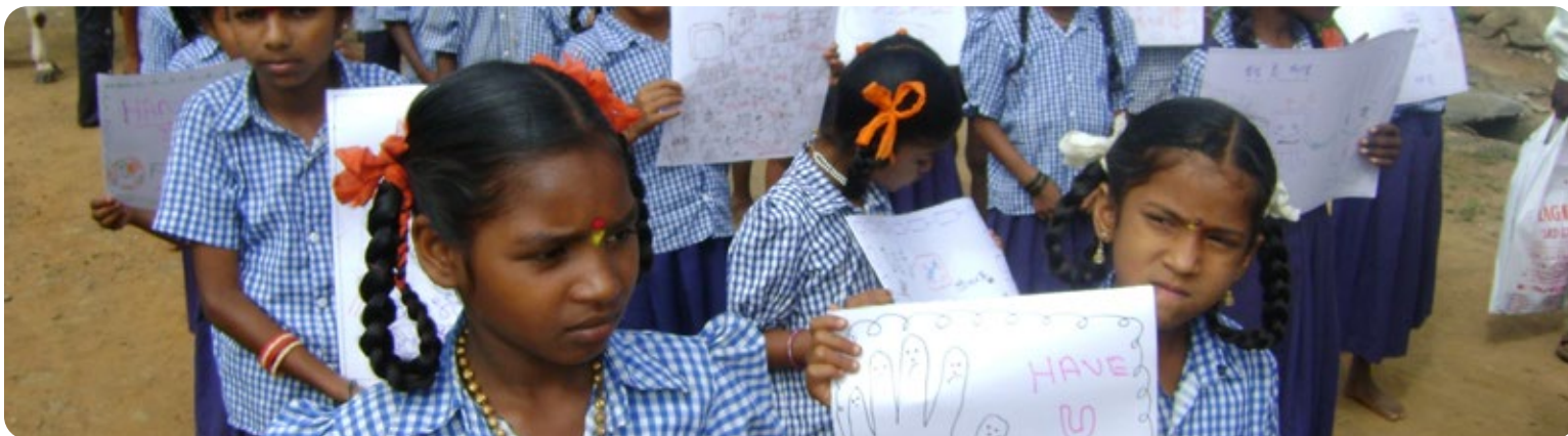
Global Hand Wash Day for laying the foundation for a healthy life