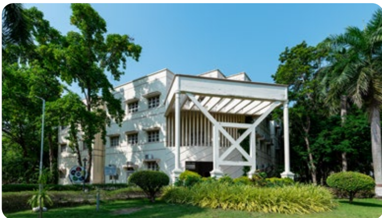
GMR Institute of Technology at Rajam, in the aspirational district of Vizianagaram, Andhra Pradesh