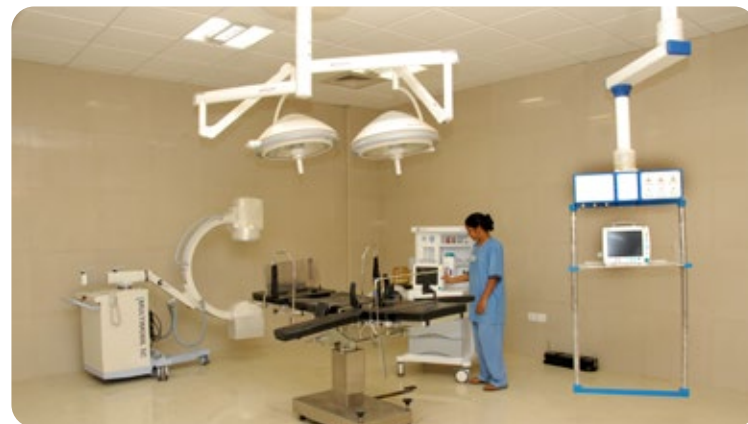
Hi-Tech Operation Theater