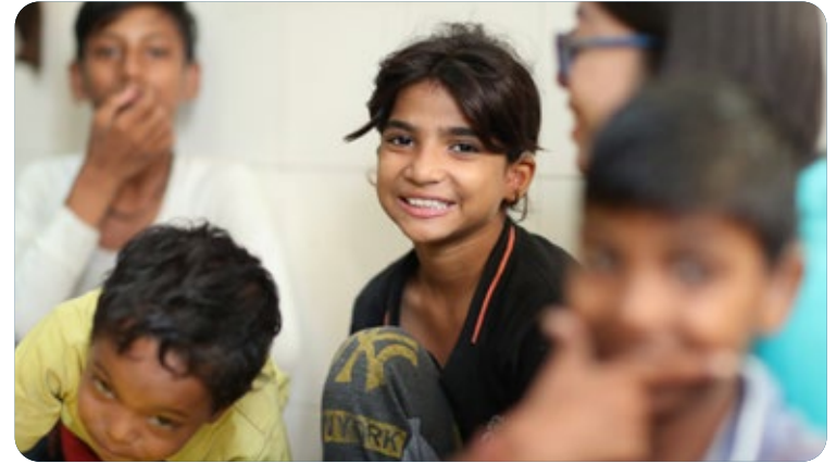
Empowering the differently-abled by facilitating special education for children with disabilities