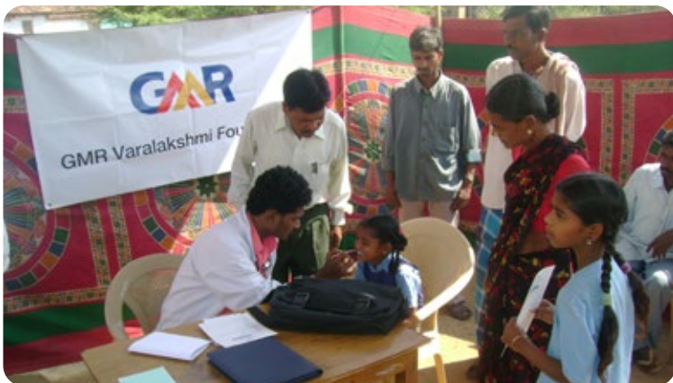
School health check-ups undertaken in partnered government schools