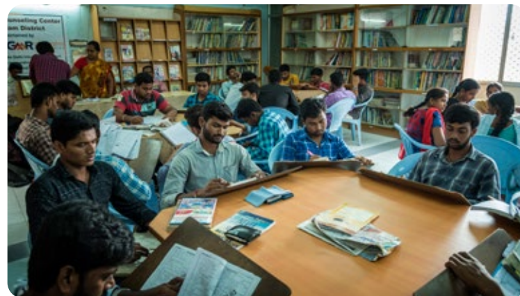
Pratibha Library for career counselling and coaching