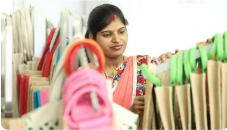
EMPOWER is an initiative which helps women develop skills and market their products