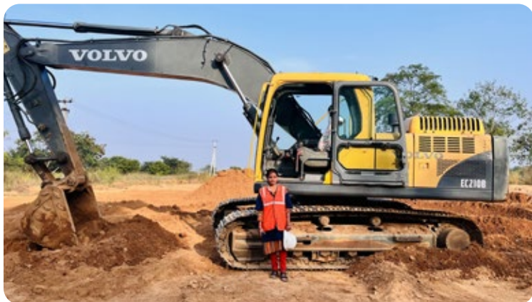
Excavator operator training