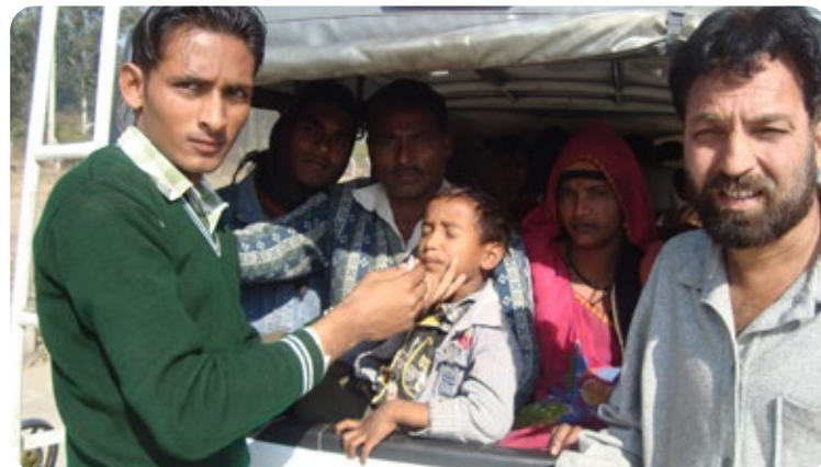
Support to pulse polio campaign