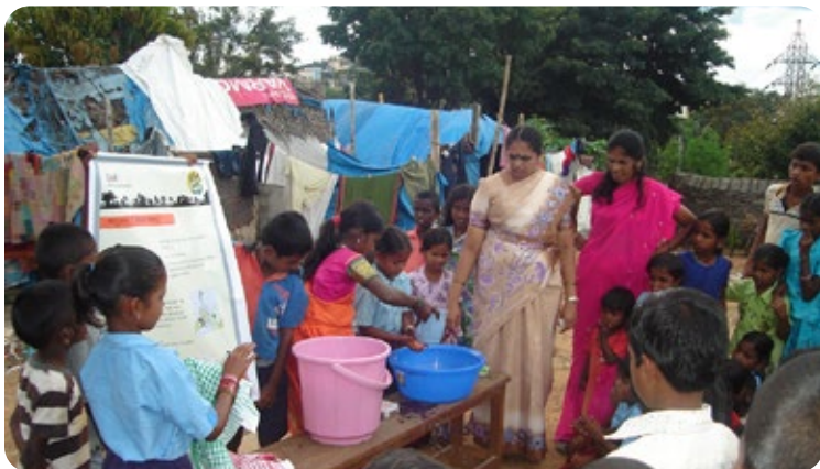
Health awareness for children of migrant labour