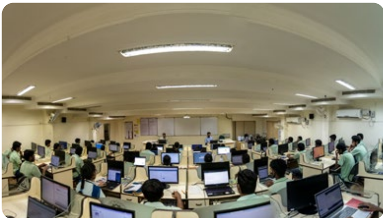
Computer lab at GMRIT