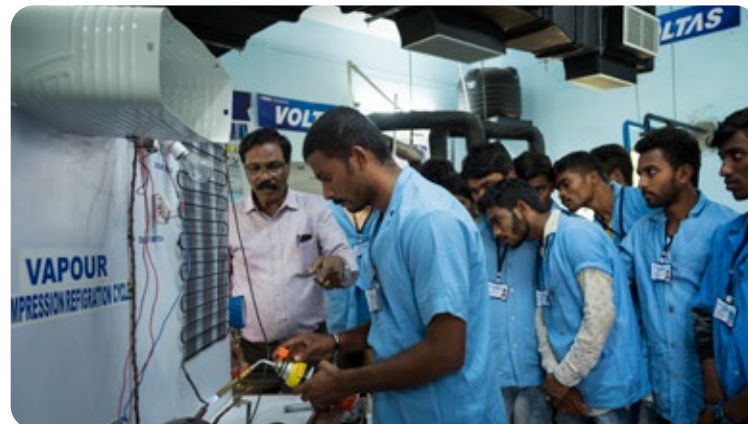
Refrigeration and AC training