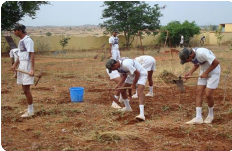
GMR colleagues cleaning the local school premises

Groups of spouses of employees have also been created who undertake social work.