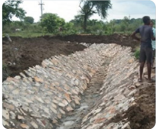
Community infrastructure support