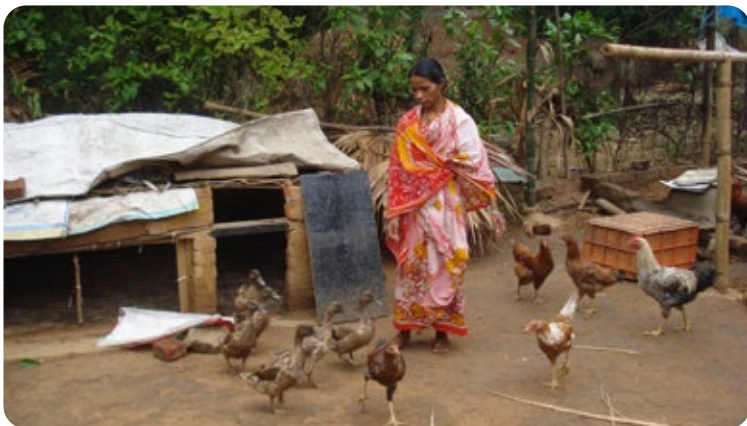
Promotion of backyard poultry