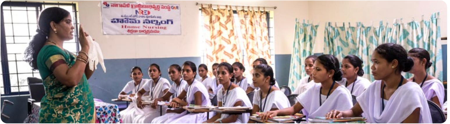
Home nursing training