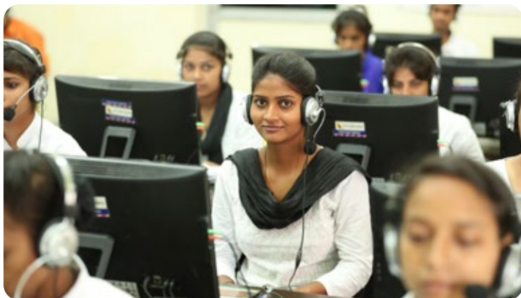
Computer data entry operator training