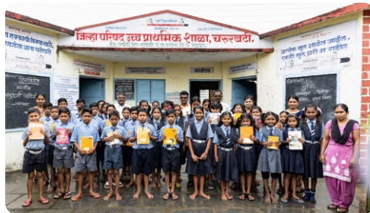
30,000 government school children benefitting regularly through GMRVF initiatives