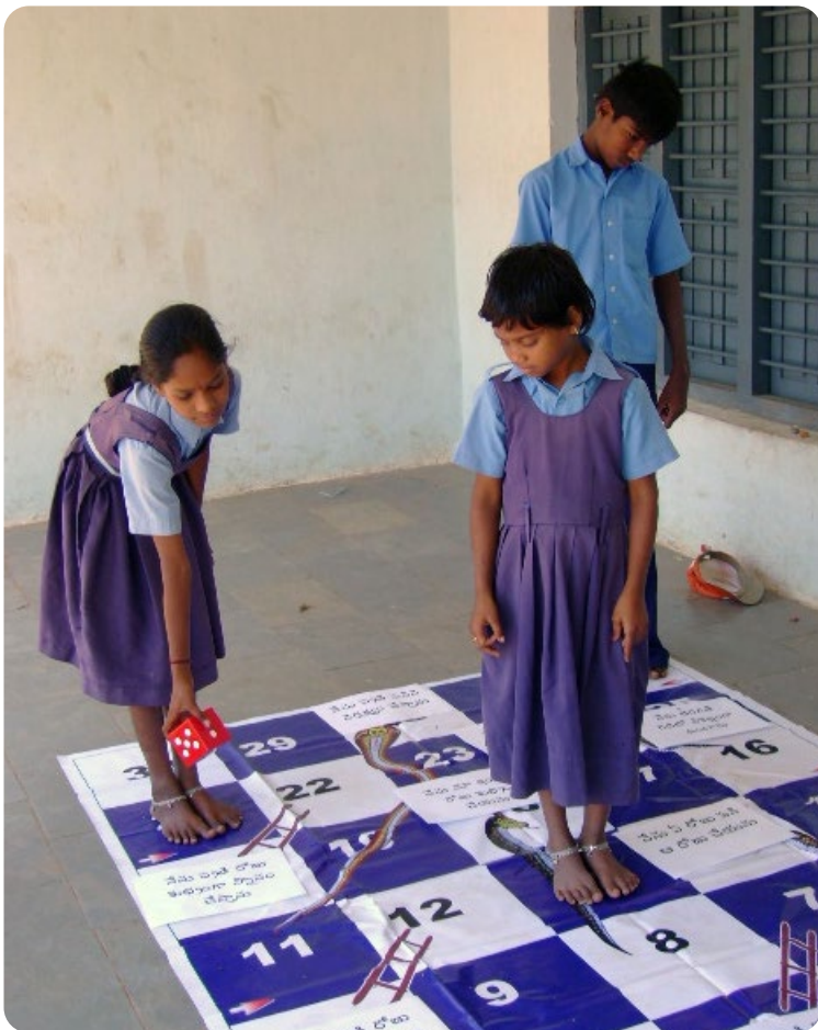
Experiential learning opportunities for government school children