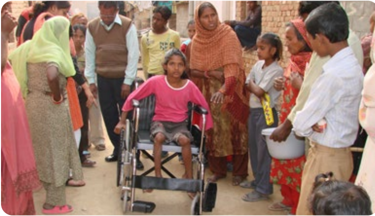
Program to support the differently-abled