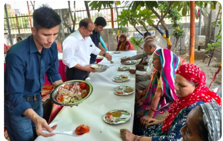
GMR colleagues distributing food