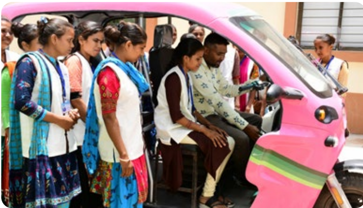
E-Autos trainees from the Ekta Skill Development Centre