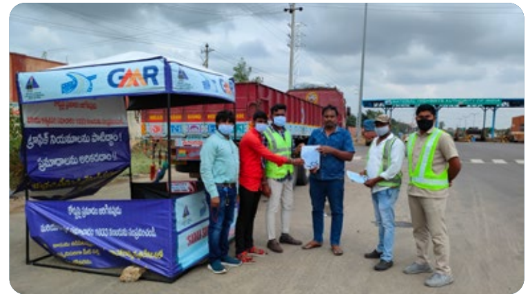
Road safety awareness programs